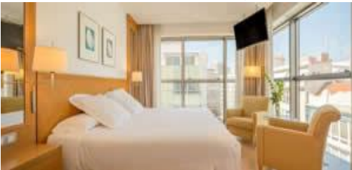
NH Coruña Centro (4*)