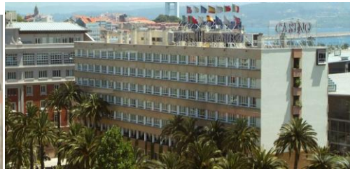
NH Atlántico (4*)