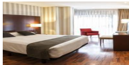
Hotel Zenit (4*)