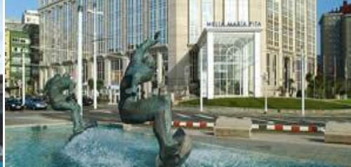
Meliá María Pita (4*)