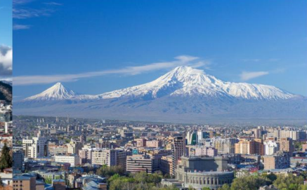
Mount Ararat and the Yerevan skyline in spring