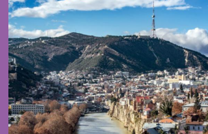
Tbilisi, view from Sheraton Grand Tbilisi Metechi Palace