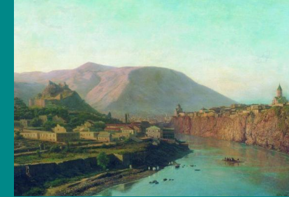
Old Tbilisi – Lev Lagorio – 1886