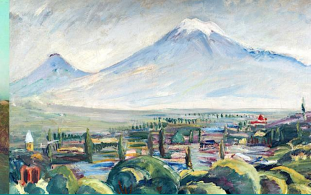
Small, Large Ararat and Yerevan – Martiros Sarian – 1930