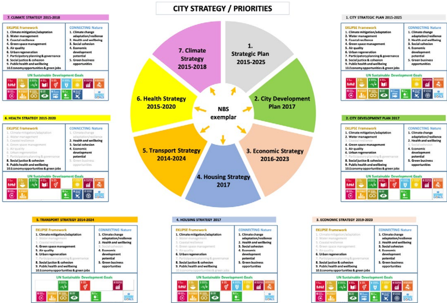
Figure 3. Example of the connection between city strategic goals, United Nations Sustainable Development Goals (SDGs) and nature-based solutions frameworks

Our Connecting Nature city partners have done this with their nature-based solution exemplars, to align the goals of the project with broader city-level and global goals, but any organisation, from a community group to a local business, could do this with a bit of research. See the example of Glasgow in Figure 3 below.