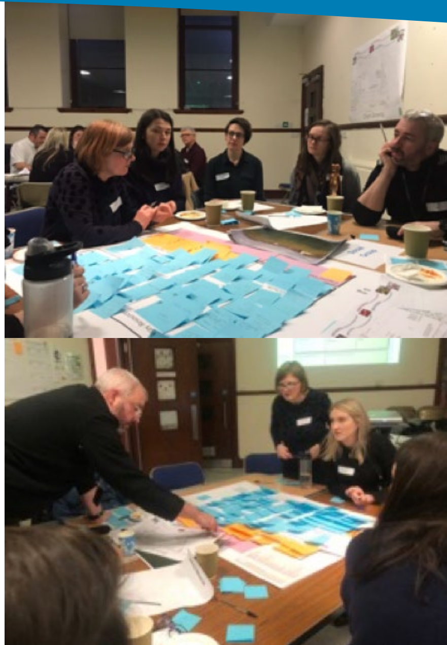
Drumchapel community engagement.