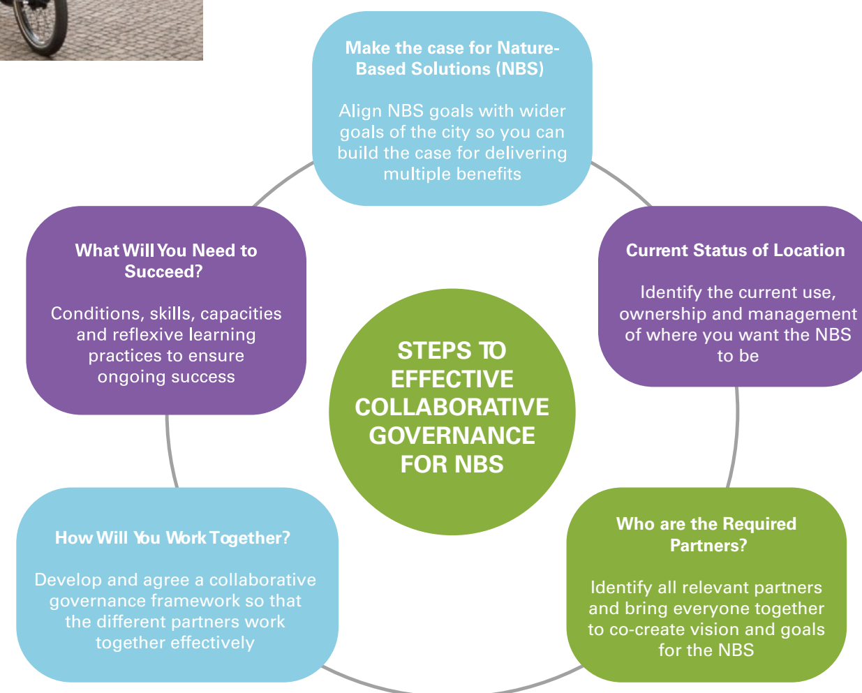
Figure 2. The steps to develop a collaborative governance process

See below for more information about each step and how it could work in practice.