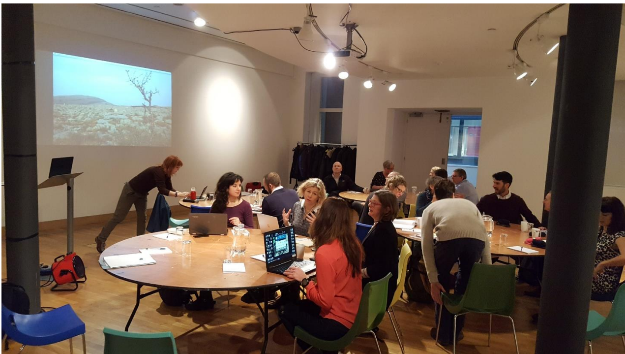
Figure 5. Example of Debrief Meeting in Glasgow, Scotland.