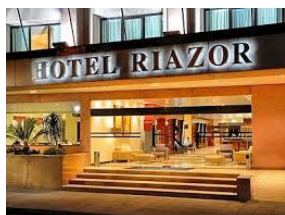
Hotel Riazor (3*)