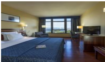
Hotel Eurostars Ciudad de la Coruña (4*)