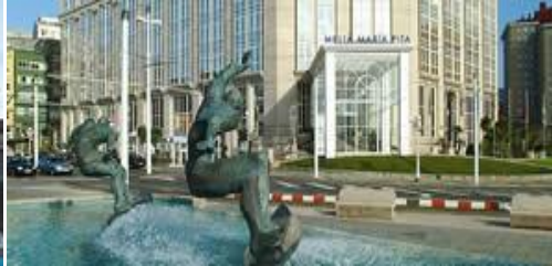
Meliá María Pita (4*)