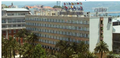
NH Atlántico (4*)