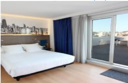
Hotel Blue Coruña (4*)